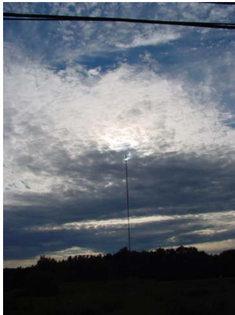
Figure 2: The single tower for radio station WGAW. The tower is a mast tower with a non-directional, circular broadcast pattern