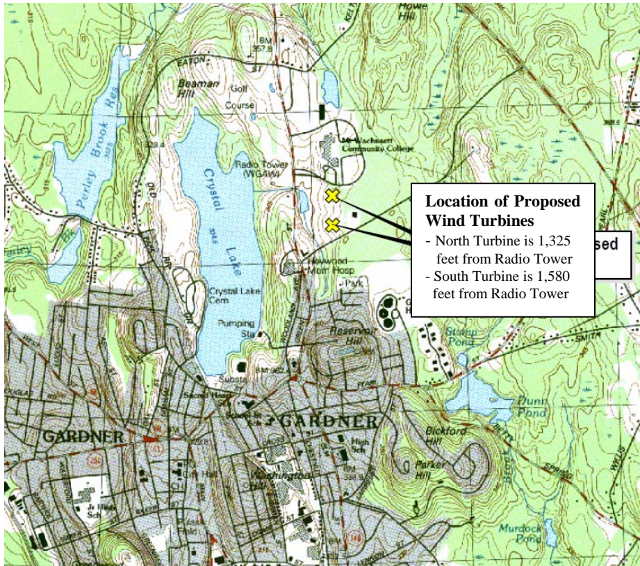
Figure 1: Map of Gardner, MA and the Mt. Wachusett Community College Campus. The radio station tower and two proposed turbine locations are indicated.